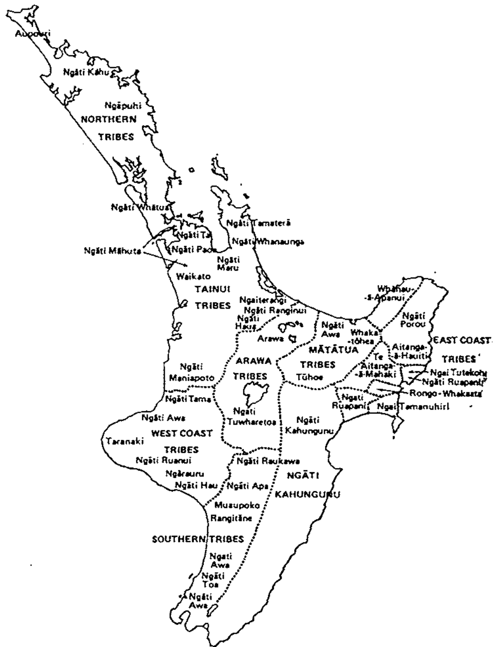
North Island Tribes